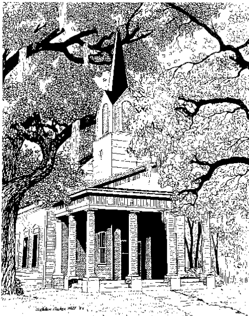
New Wappetaw Presbyterian Church McClellanville, SC

New Wappetaw Presbyterian Church 635 Pinckney Street McClellanville, SC 29458 PO Box 460 nwpconline.org