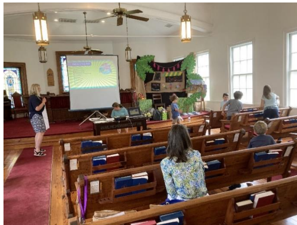
A Class Meeting and a Food Truck Emblem Visible