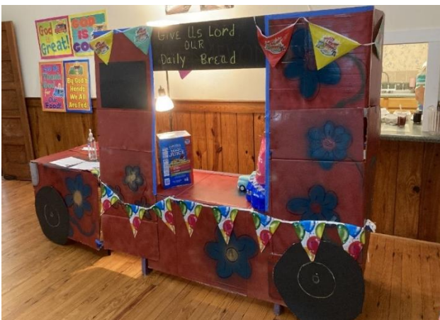
The Food Truck In the Fellowship Hall