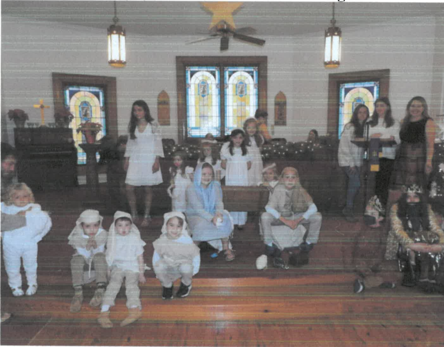
At worship, Sunday, December 19th