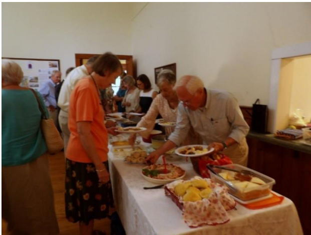
Food, Members, and Friends