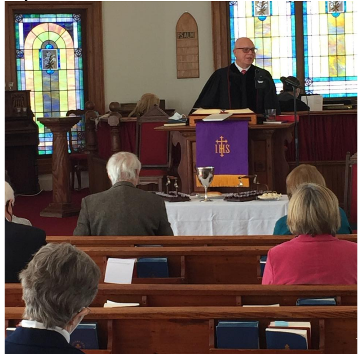
Communion was served carefully by gloved elders