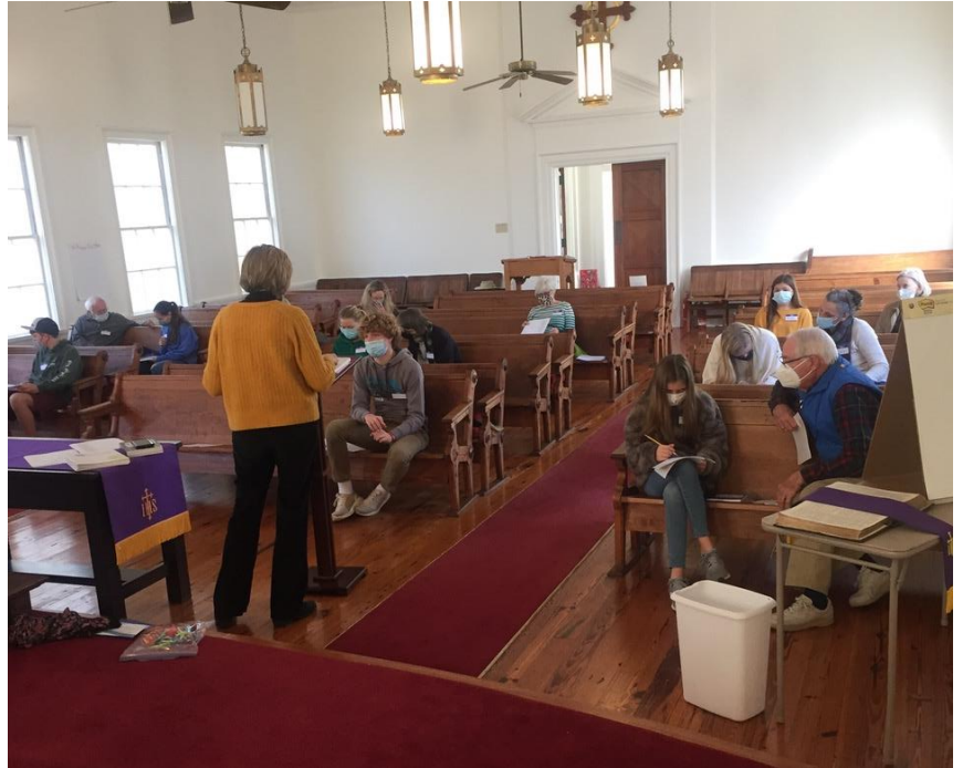
Confirmands and helpers scattered about and wearing masks