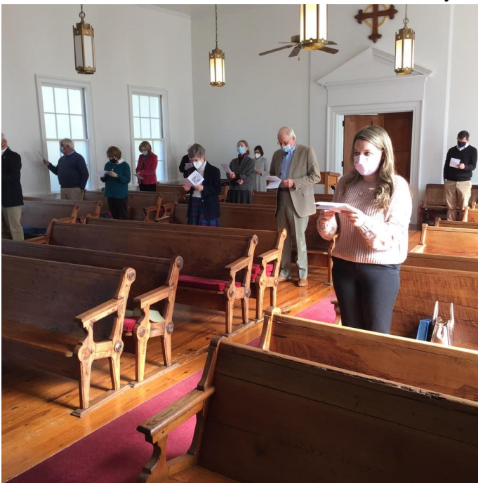
Members observing social distancing, wearing masks