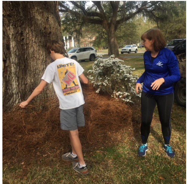
Outside work – and new brightness in the minister’s office