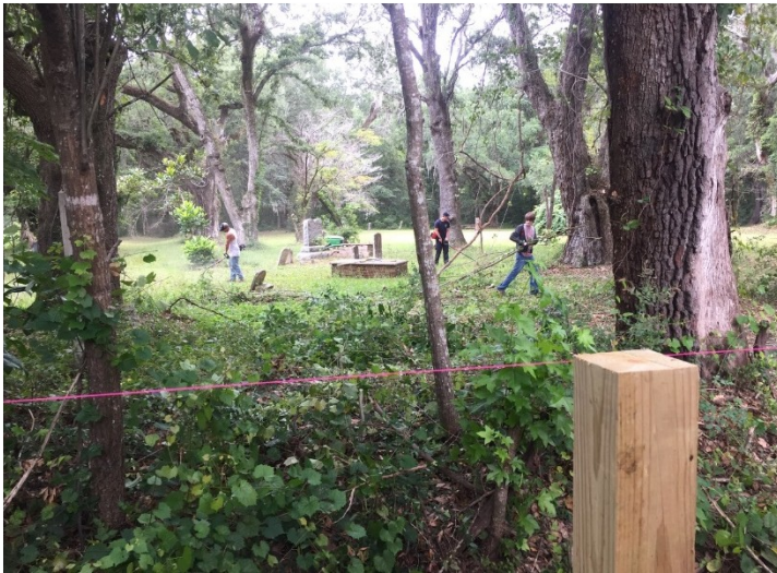
Starting the clearing