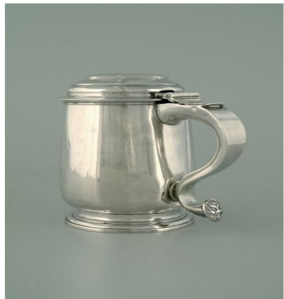
Notice the frowning “Mask Terminus” at the handle end