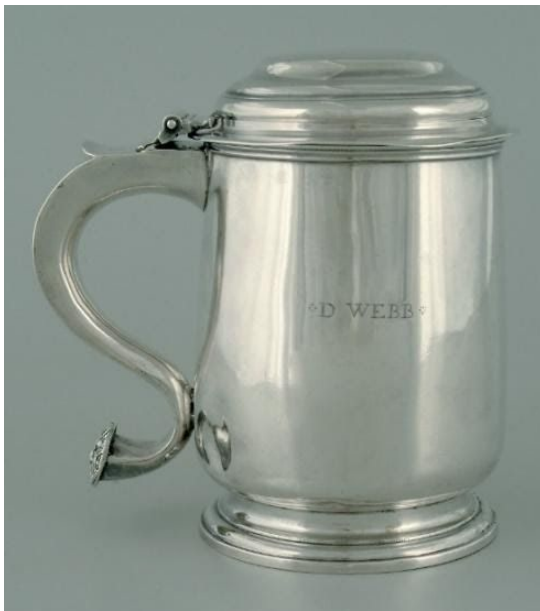
Signed --- D. Webb