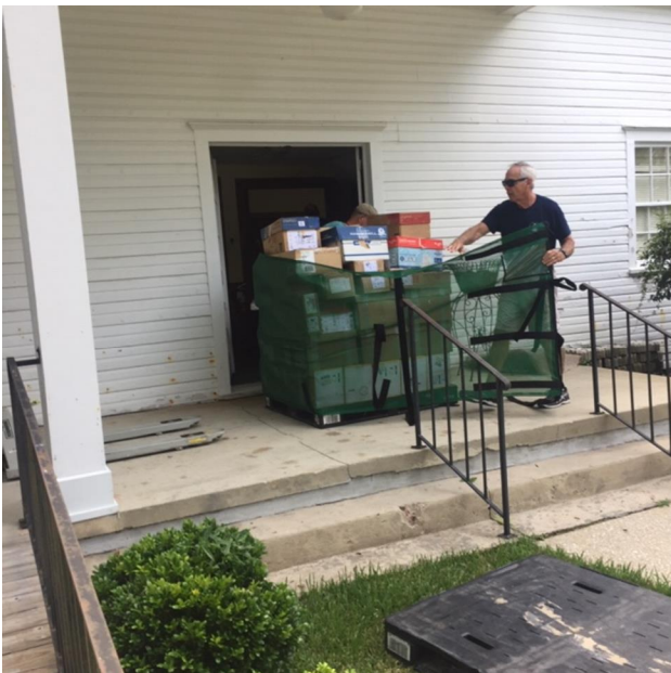
Unloading Clothes from a Large Van