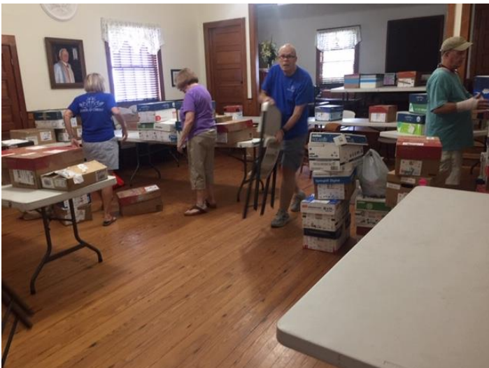
Arranging the Clothes