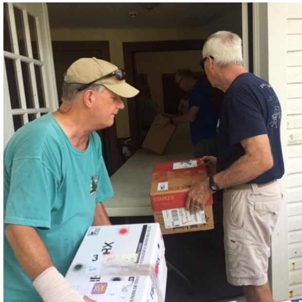
Shuttling the Boxes In