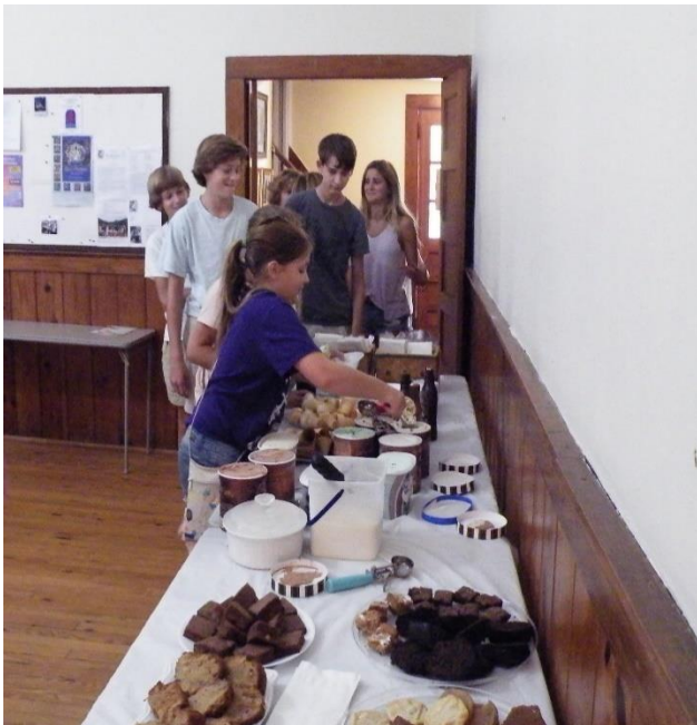
The Ice Cream Social – Just Getting started A big crowd enjoyed the ice creams, cakes, and cookies

New Wappetaw Presbyterian Church 635 Pinckney Street McClellanville, SC 29458 PO Box 460 newwappetawpc.com