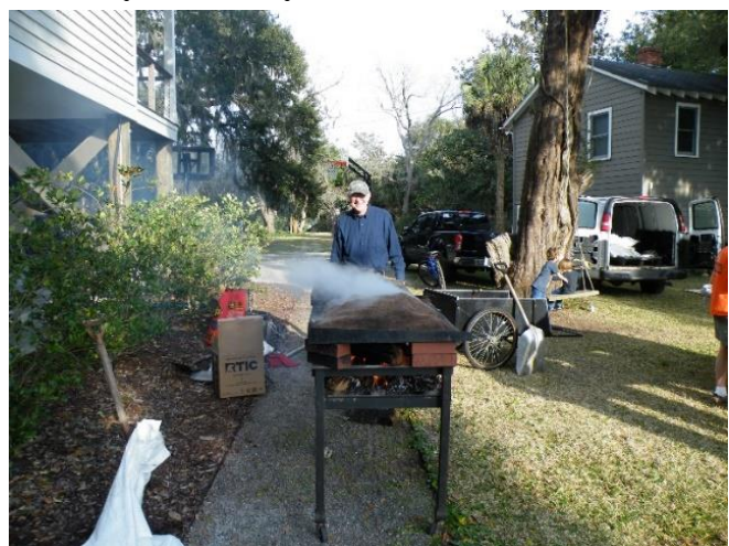
Roasting the oysters