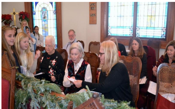
Giving their leaders presents of gift cards