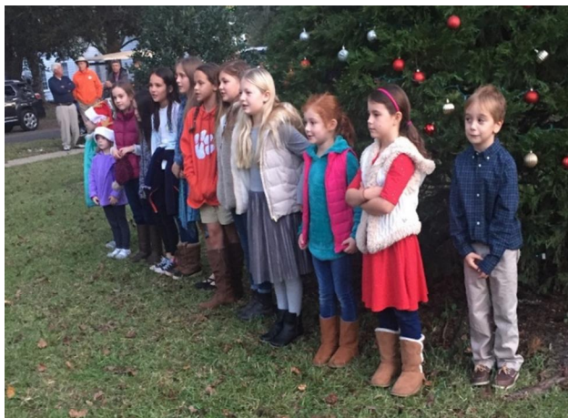
At the Lighting of the Town Christmas Tree