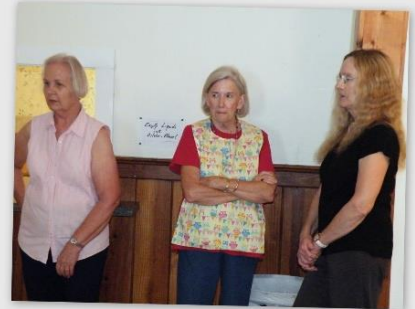
Ice Cream Social Aug 19,2018