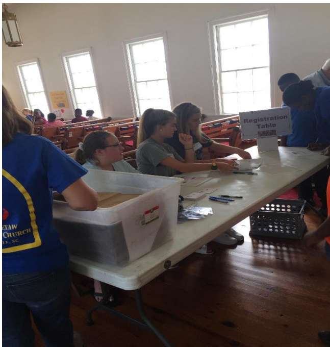
Our youths served at the registration desk and others helped children in shopping

The seventh Hands of Christ distribution at New Wappetaw on Wednesday, August 15 th was a great success. Over 60 children were provided clothes and school supplies. The Hands of Christ team, based at the Westminster Presbyterian Church in Charleston, once again enjoyed being with us. Many New Wappetaw members helped set up the hall, provided food, registered the children, and helped children shop for their items.