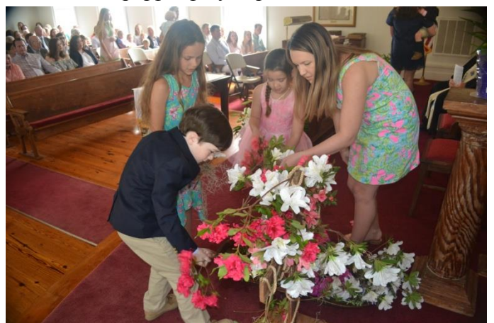
Adding flowers to the cross