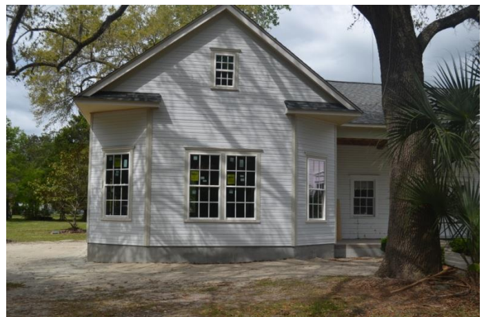
On April 21 st