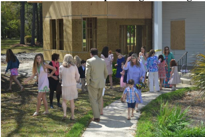
At Easter – April 1 st