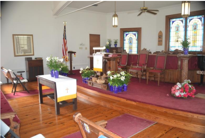
The sanctuary was beautiful