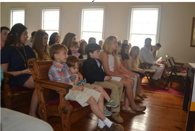
Enjoying the sermon