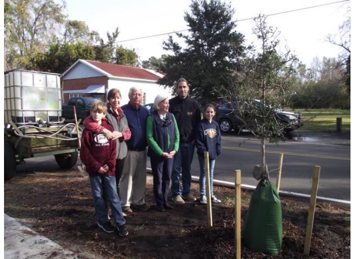
The mayor with his family